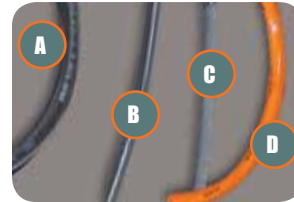
A = 3/8" I.D. Polyurethane B = 1/4" I.D. Polyurethane C = 1/4" & 3/8" I.D. Rubber D = 1/4" I.D. Non-Conductive