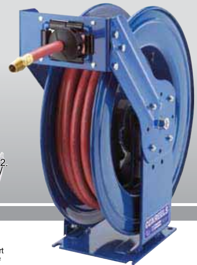
Triple axle support with a full frame & Super Hub™