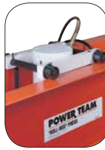
Cylinder is easily moved across width of upper bolster.