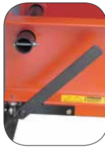
Lever lowers bed for pressing, raises it for rolling.