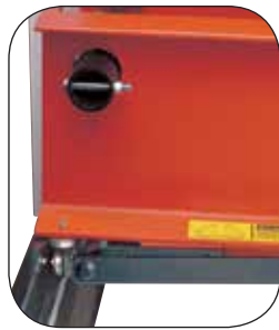
Bearings make bed positioning smooth and easy.