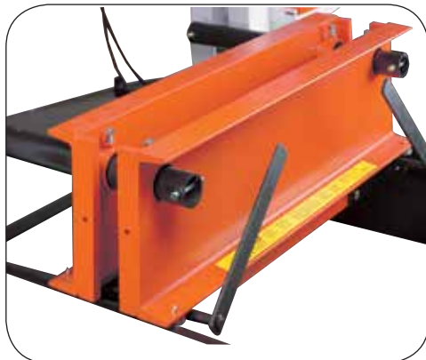
Width adjusts from 4" to over 27"; is secured with locking bolts.