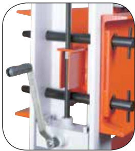
Lifting screw and locking pins make bolster raising a one-man job.