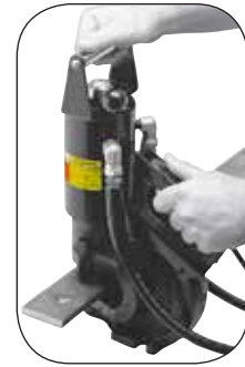
Punch Set HP20SP Includes the PE102A pump, hoses, couplers, punch and die sets in sizes \frac{1}{4} ", \frac{5}{16} ", \frac{3}{8} ", \frac{7}{16} ", and \frac{17}{32} " diameter, with storage box.