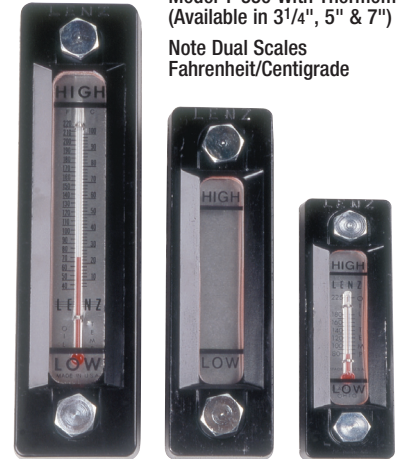
T-550-7 550-5 T-550-3

(ethylene-propylene for phosphate ester base fluids)