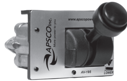
AV-195 (Hoist only)