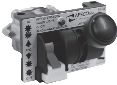
AV-295 (PTO and Hoist)