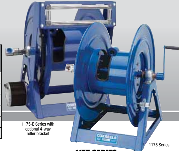
1175-E Series with optional 4-way roller bracket