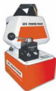
PE554W Weather-resistant model