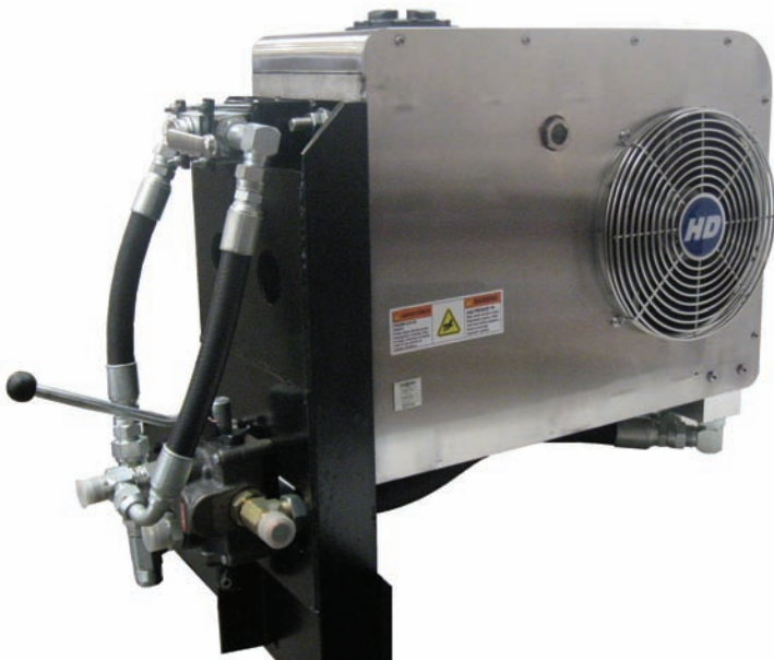
Dual component HydraFLOW system with built-in selector, directional & speed control