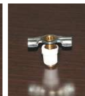
Bleed Valve P/N: CK-011