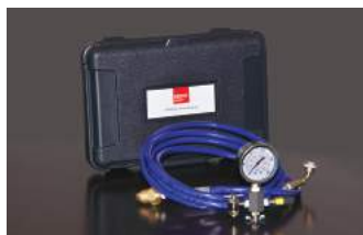
C&G Kit P/N: CKT-0030