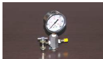
C&G Kit P/N: CKM-0030