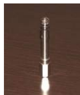
Valve Extension P/N: CK-013