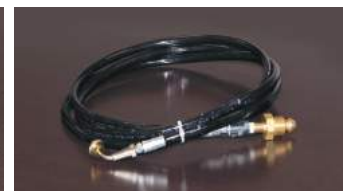
Hose Assembly P/N: CK-014