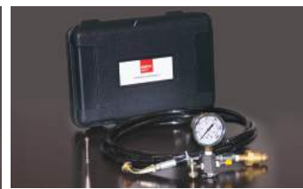
C&G Kit P/N: CKT-T-0030