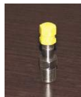
Tank Valve P/N: CK-010