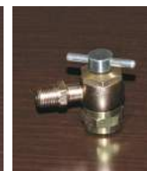
Air Chuck P/N: CK-005