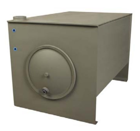
NOTE: All dimensions are inches [mm]