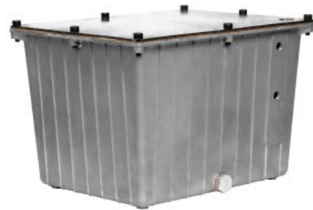
Tank Dimensions (inches)