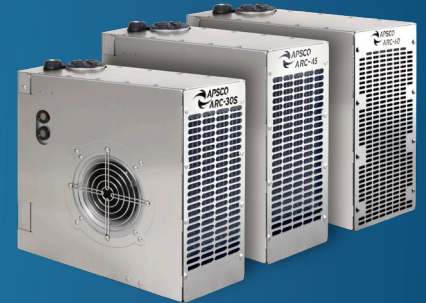
ARC-30S ARC-45 ARC-60

PART OF APSCO'S COMPLETE LINE OF COOLING SYSTEMS